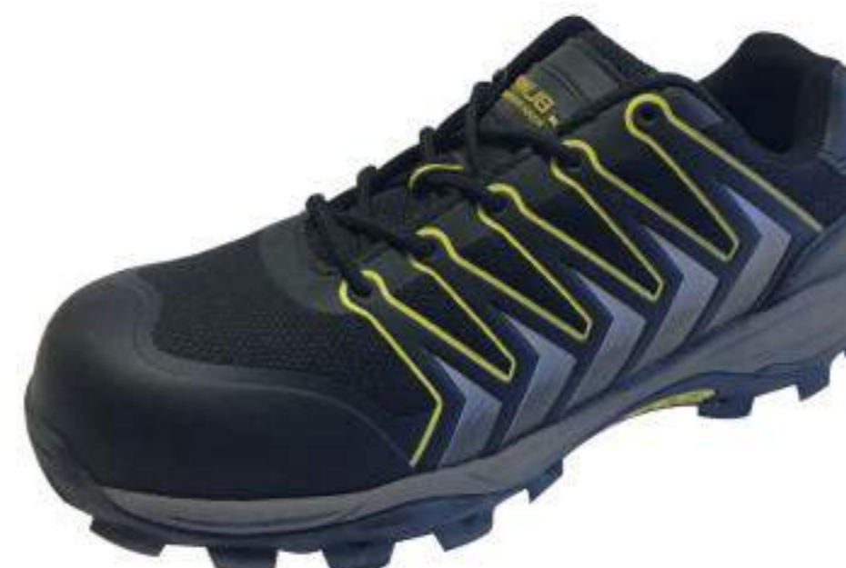
FBOS-HN113-3 full grain leather air mesh lining EVA+rubber sole