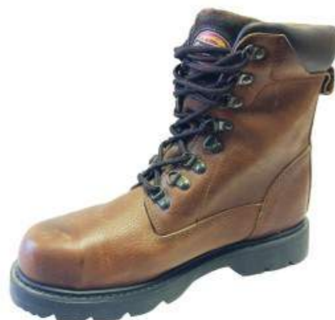
FBOS-RG6 crazy horse leather 6"