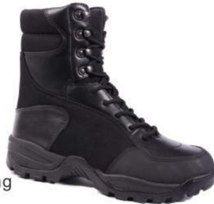
FBOS-HN3052 cow grain leather 9" cementing and side sticking campela lining rubber sole