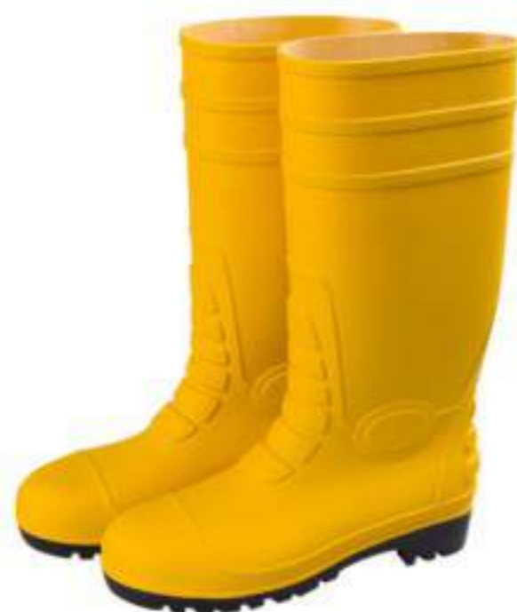
FBOS-ZY002GB w/o steel toe w/o steel sole, with steel toe w/o steel sole, with steel toe with steel sole 10pairs 22/20kgs 50x30x43cm 3700 pairs/20'