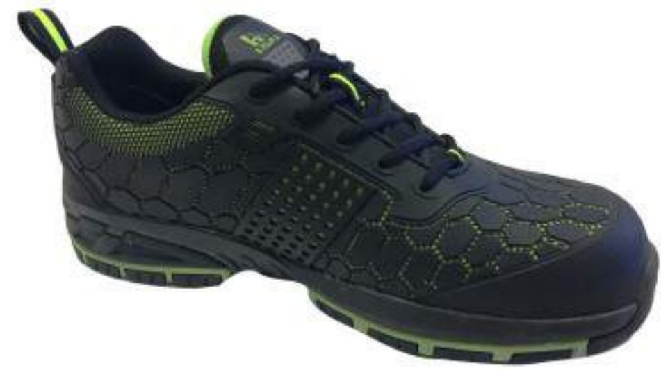
FBOS-HN500B-3 full grain leather+mesh air mesh lining rubber sole