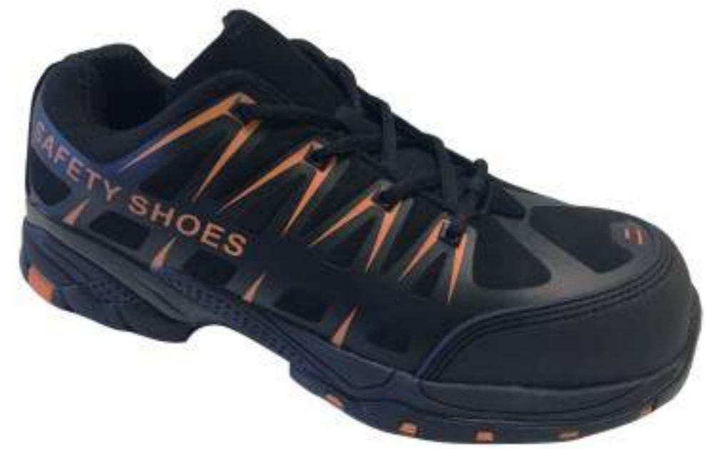
FBOS-HN115-7 full grain leather air mesh lining EVA+rubber sole