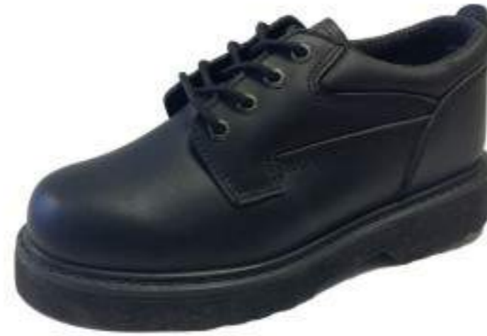
FBOS-BF4 full grain leather 4"