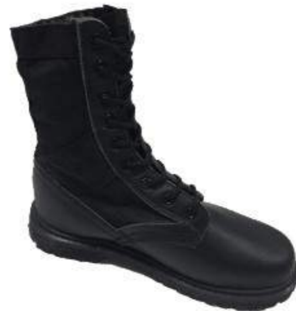
FBOS-MJ28 cow grain leather 9" oxford cloth waterproof campela lining machine sewing lining rubber sole