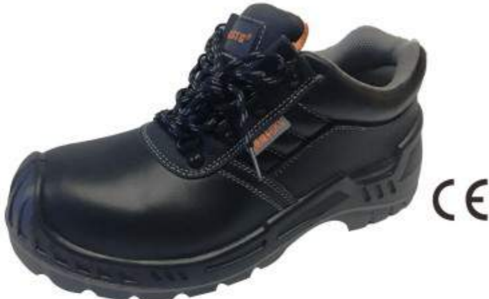
FBOS-H2-C100A buffalo leather campela lining PU/PU sole