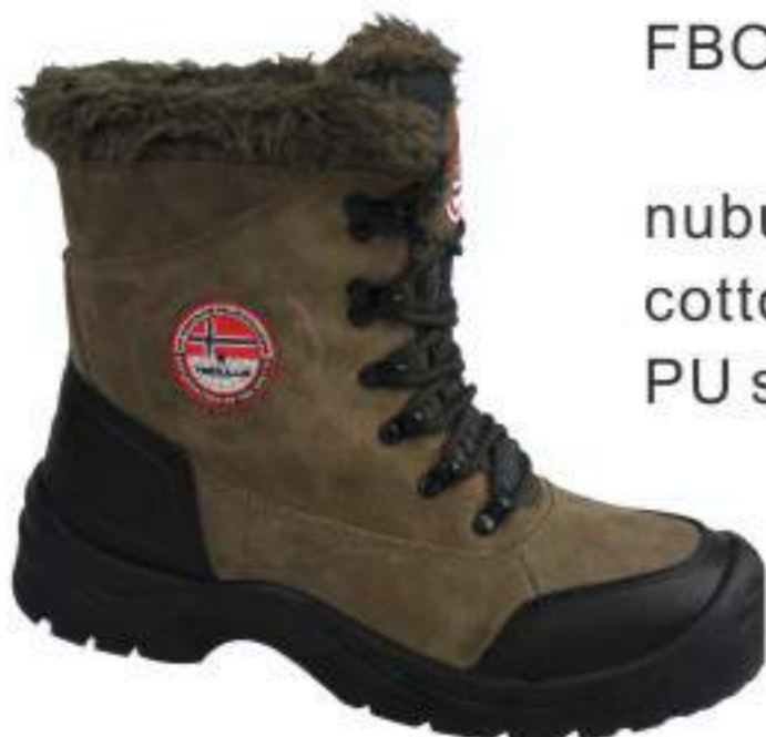
FBOS-PU0439 nubuck leather 8" cotton lining PU sole