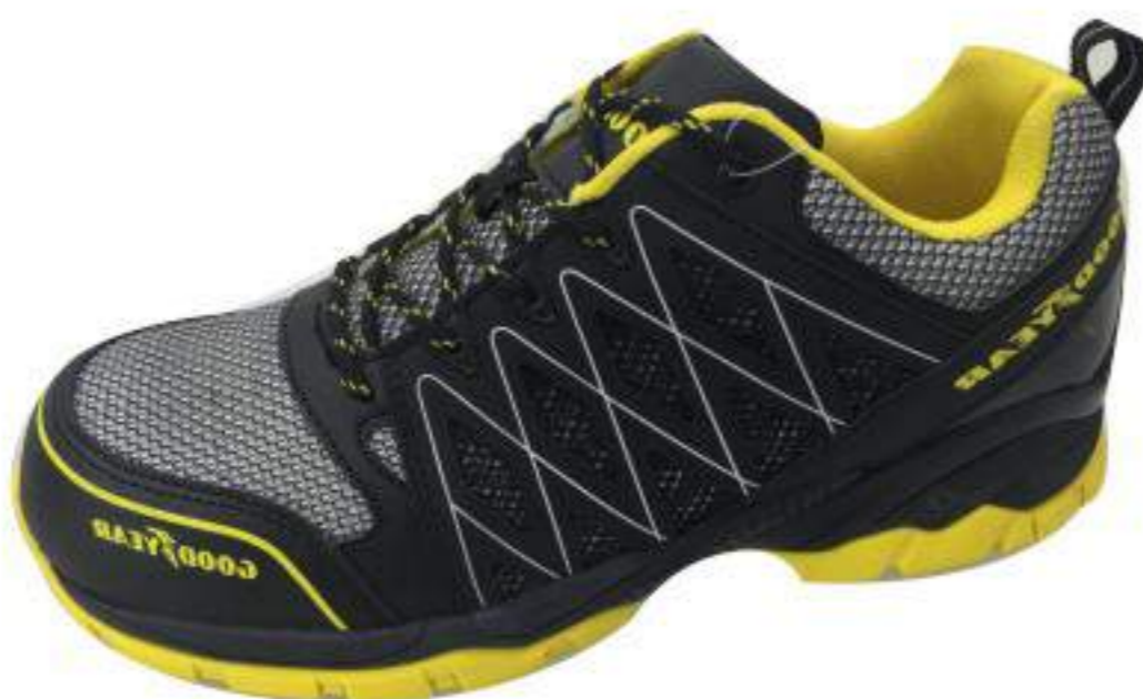
FBOS-HN9005L PU+mesh lining air mesh lining EVA+rubber sole