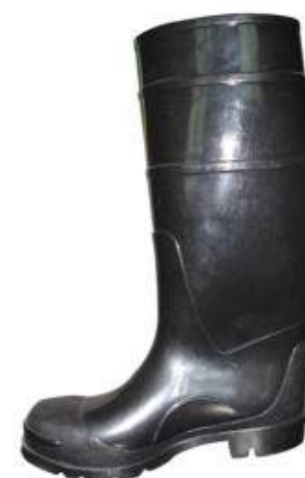
FBOS-ANA-002 w/o steel toe w/o steel sole 10pairs 18/16kgs 50x30x43cm 4400 pairs/20'