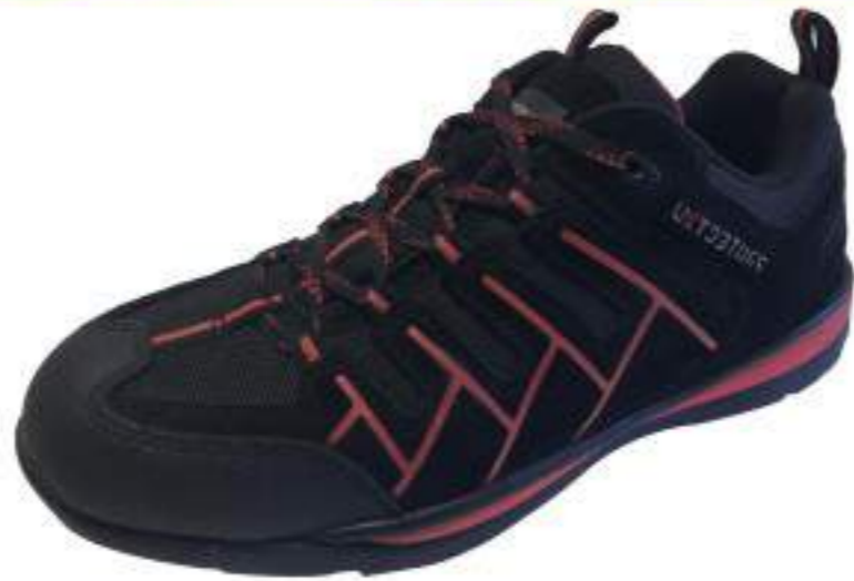
FBOS-7000H1 suede leather air mesh lining EVA + rubber sole

Sole EVA + rubber:anti-heating; light weight wear-resisting