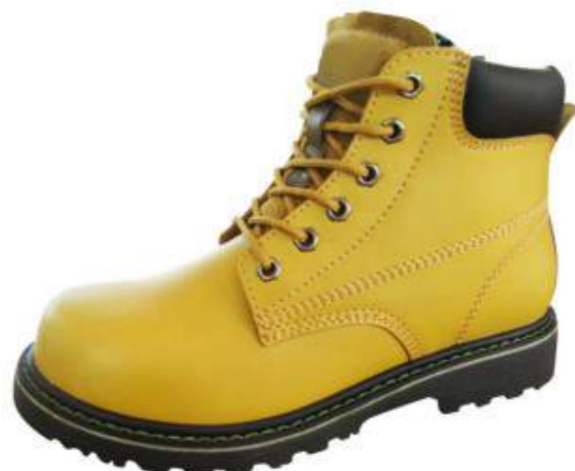
FBOS-UG377 Nubuck leather campela lining oxford sole