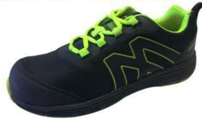
FBOS-7000H2 move ground leather air mesh lining EVA + rubber sole