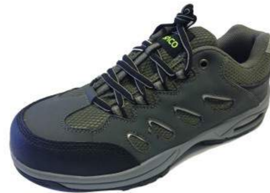
FBOS-HN064-1 full grain leather air mesh lining EVA + rubber sole