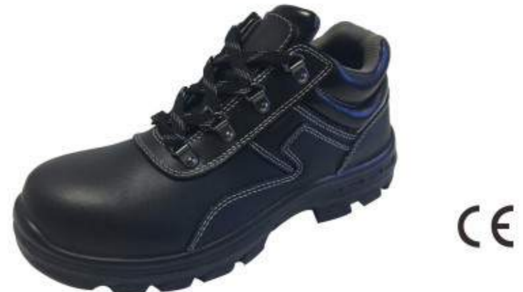
FBOS-UP705 buffalo leather campela lining PU/PU sole