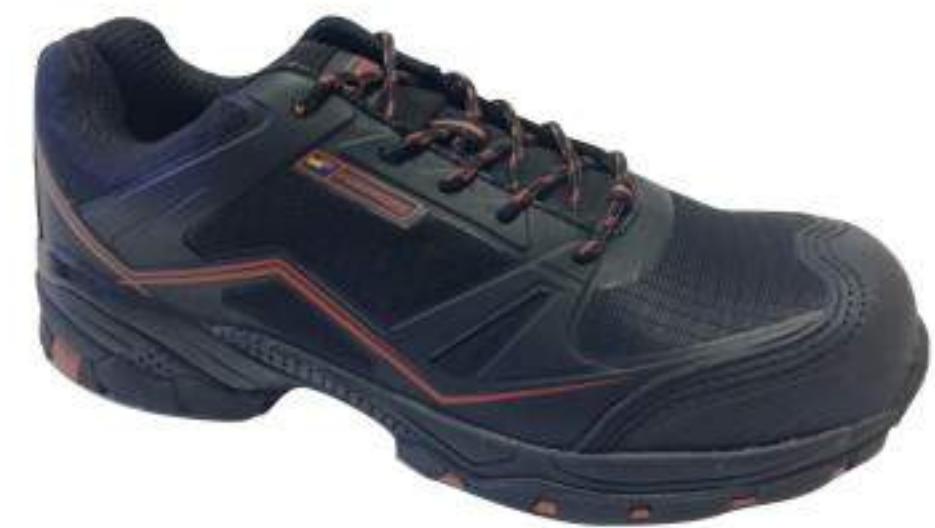
FBOS-HNL1008 full grain leather+mesh air mesh lining EVA+rubber sole