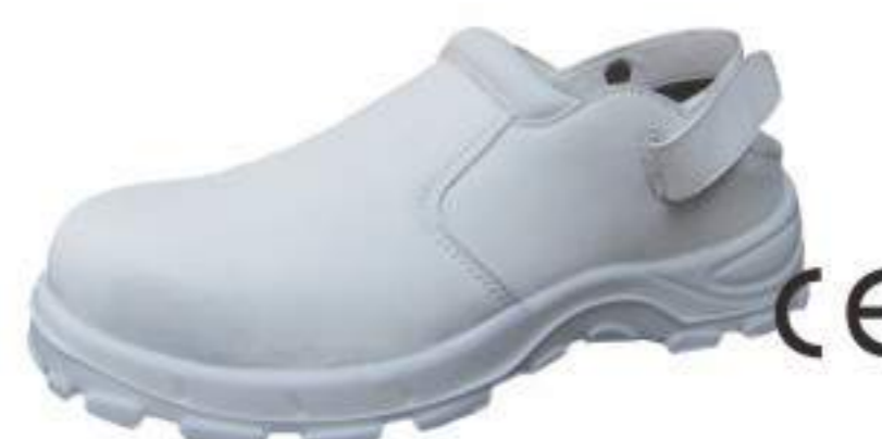
FBOS-UQ547 lorica leather campela lining PU/PU sole