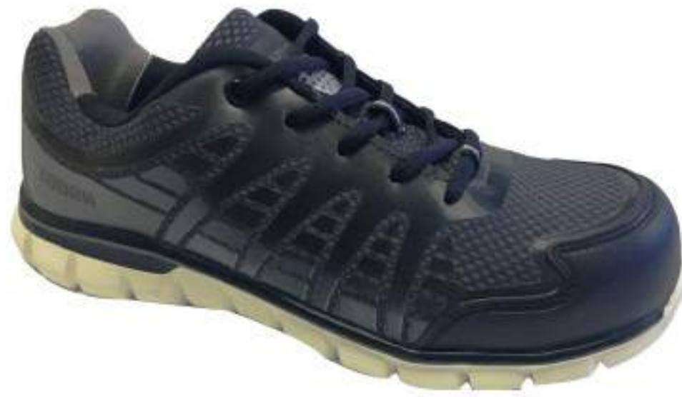
FBOS-HN500B-5 full grain leather+mesh air mesh lining rubber sole