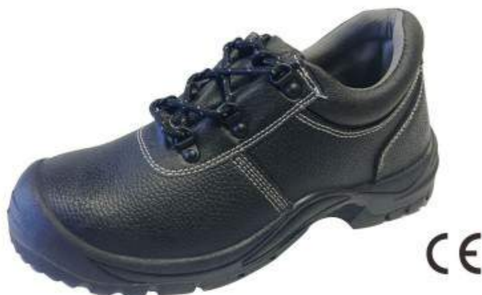
FBOS-H2-2073 buffalo leather campela lining PU/PU sole