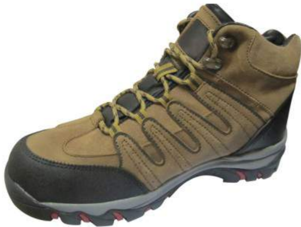
FBOS-HN1510 nubuck leather air mesh lining EVA+rubber sole