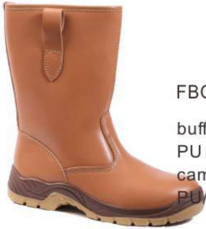
FBOS-UF694 buffalo leather 9" PU injection campela lining PU/PU sole