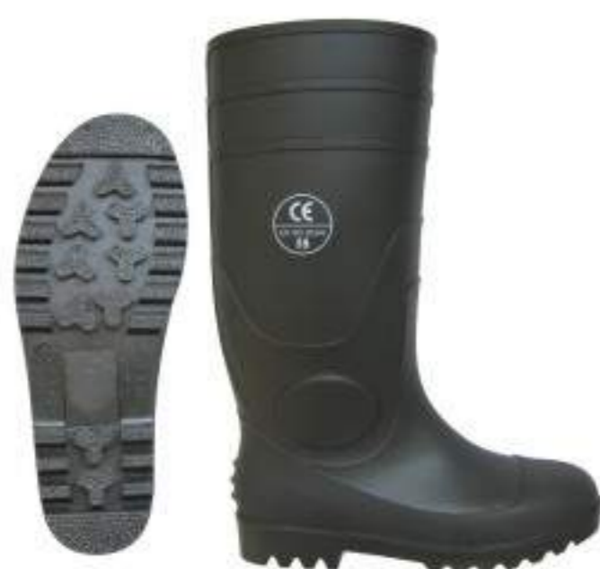
FBOS-ANA-001A 400 mm high 10pairs 25/23kgs 43x43x45cm 3250 pairs/20'

water proof fire proof Oil resistance Non slip Anti-squashing Anti-acid Anti-alkali Anti-aging Anti-corrosive Anti-puncture