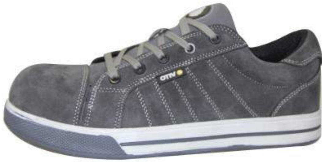
FBOS-HN300B-3 suede leather air mesh lining rubber sole