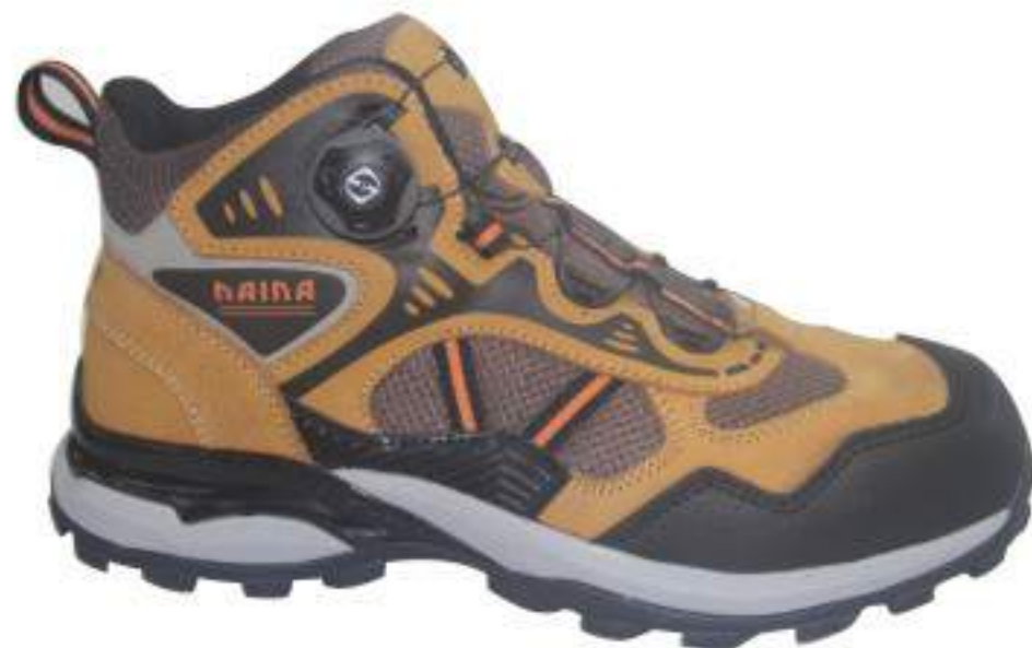
FBOS-HNK2017 full grain leather+mesh air mesh lining EVA+rubber sole