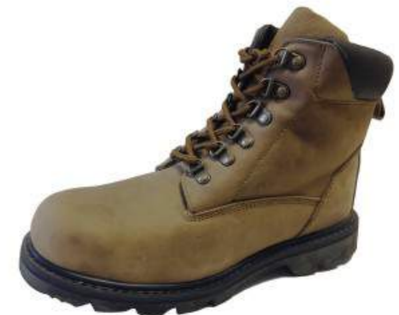
FBOS-RCG6 crazy horse leather 6"