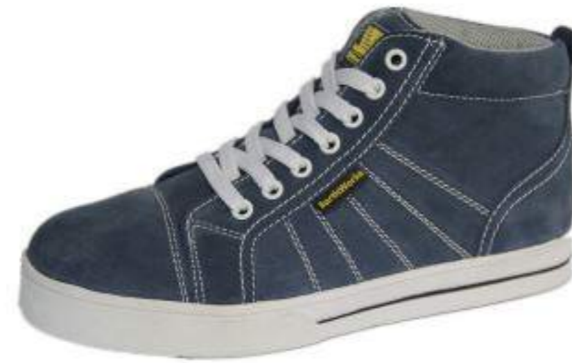
FBOS-HN300B suede leather air mesh lining rubber sole