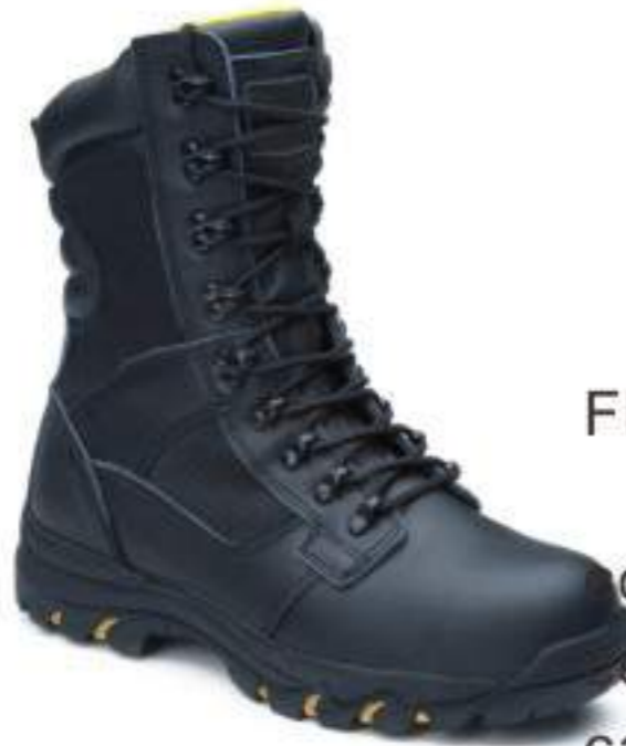
FBOS-HN7222 cow grain leather 9" cementing and side sticking campela lining EVA+rubber sole