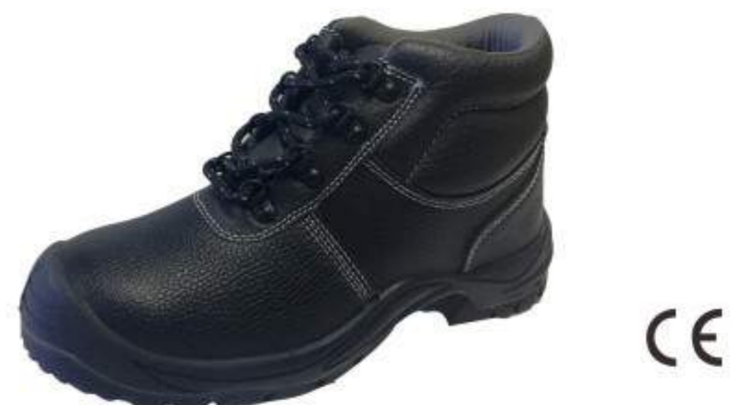
FBOS-H6-2073 buffalo leather campela lining PU/PU sole