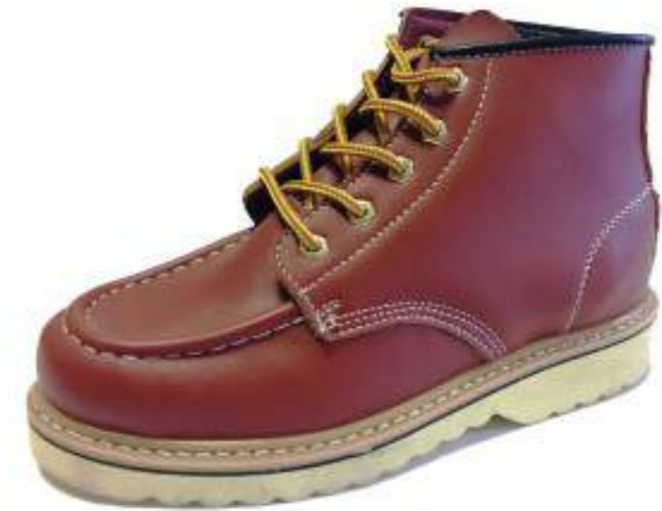
FBOS-RC6 crazy horse leather 6"