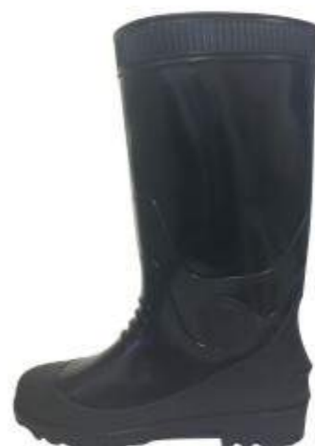
FBOS-WL012 w/o steel toe w/o steel sole 10pairs 18/16kgs 50x30x43cm 4400 pairs/20'