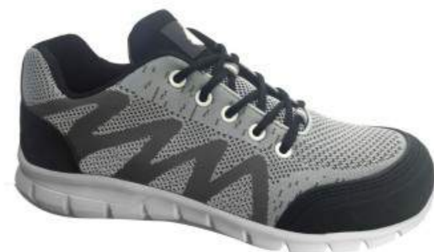
FBOS-HN18003-3 move ground leather air mesh lining EVA + rubber sole