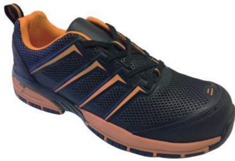
FBOS-HN1008-50 full grain leather air mesh lining EVA+rubber sole