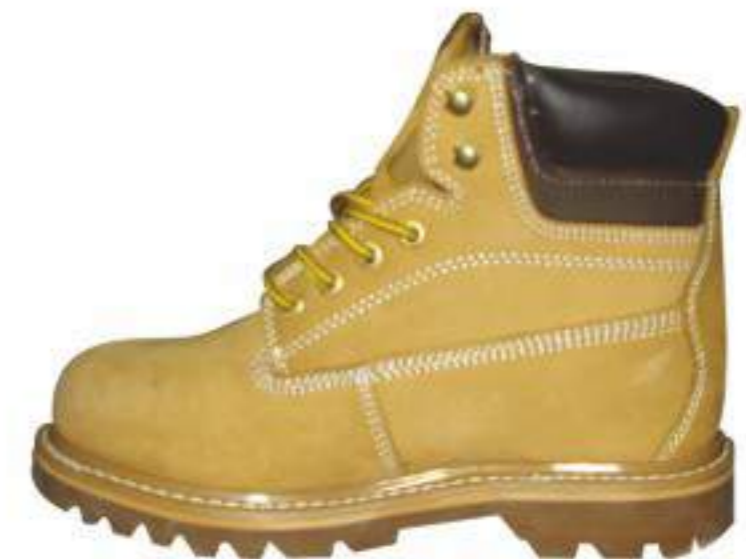
FBOS-YCN6 nubuck leather 6"