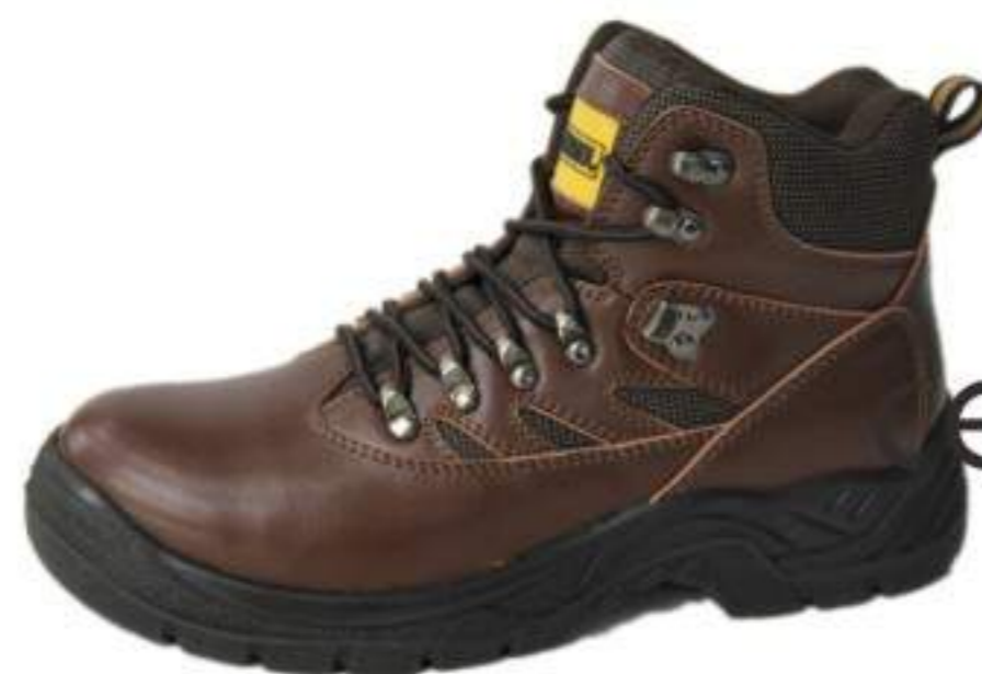
FBOS-UG378 Nubuck leather campela lining oxford sole