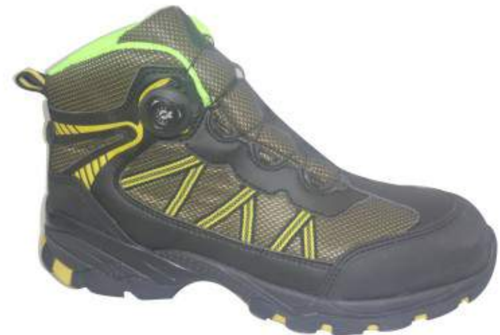
FBOS-HNK2017-2 full grain leather+mesh air mesh lining EVA+rubber sole