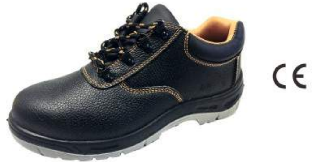
FBOS-H2-2081 buffalo leather campela lining PU/PU sole