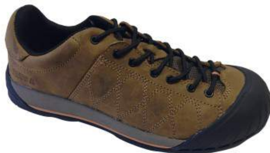
FBOS-HN3001 full grain leather+mesh air mesh lining EVA+rubber sole