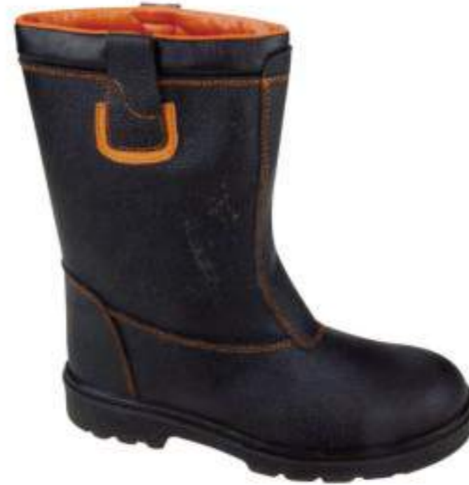
FBOS-HN3049 cow grain leather 9" PU injection campela lining PU/PU sole