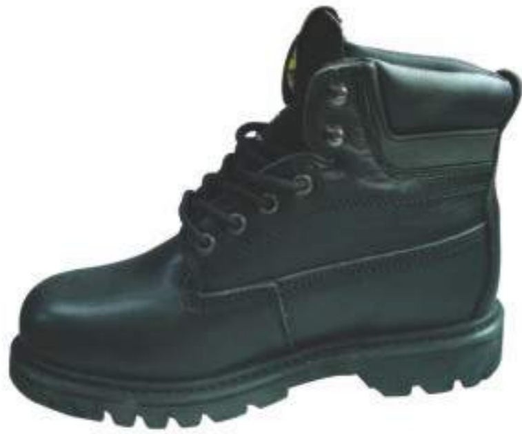
FBOS-BCF6 full grain leather 6"