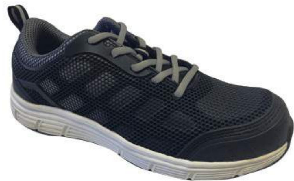
FBOS-1008-19 full grain leather+mesh air mesh lining EVA+rubber sole