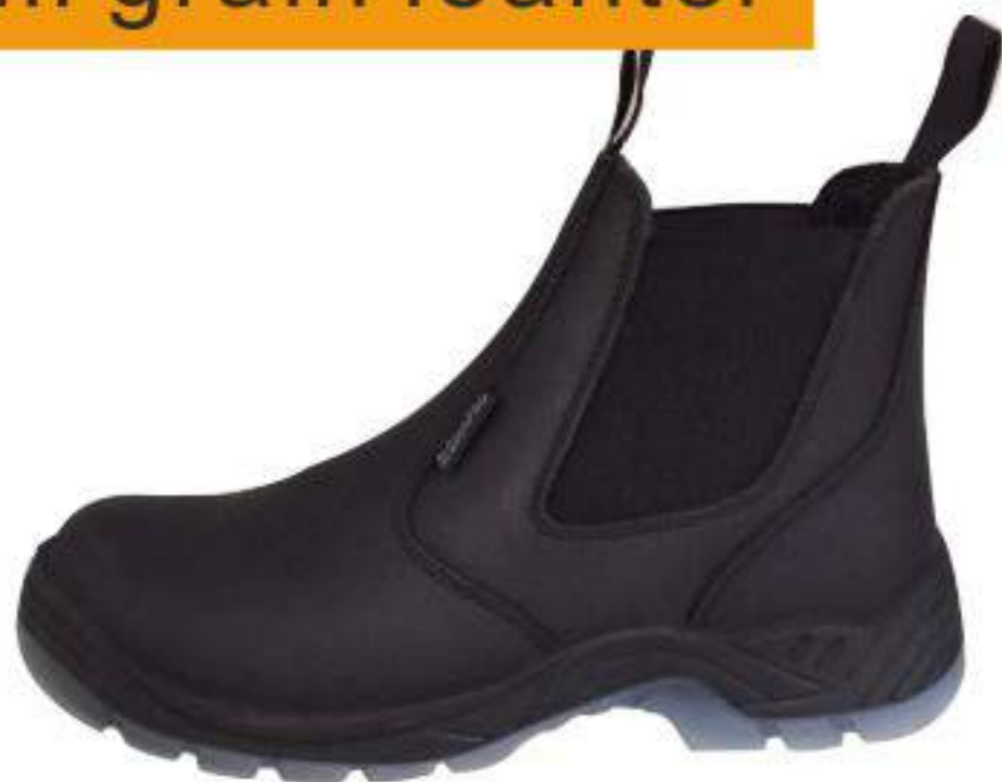
FBOS-UP371A full grain leather campela lining PU/TPU sole