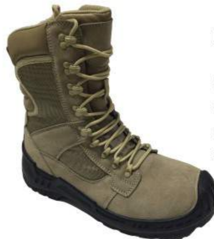
FBOS-86001 suede leather 9" oxford cloth waterproof campela lining rubber sole