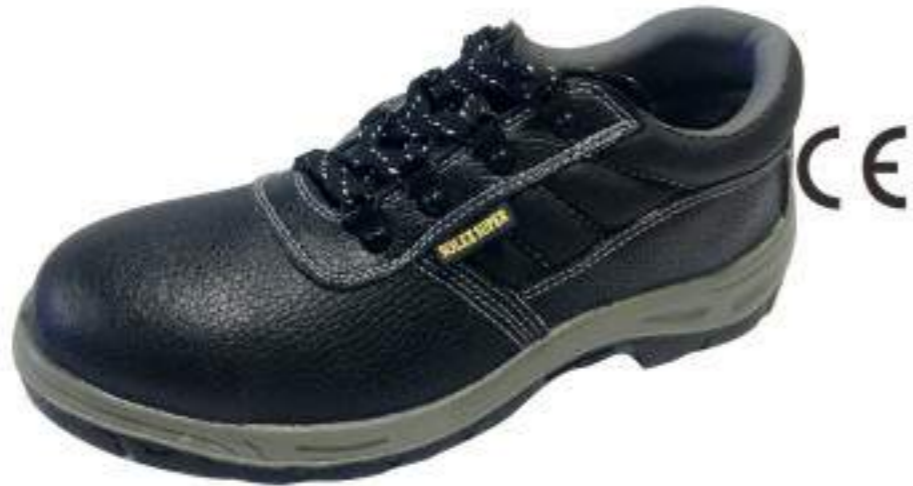
FBOS-H2-2165 buffalo leather campela lining PU/PU sole