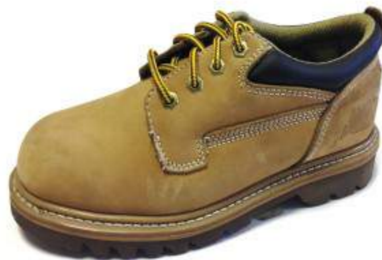
FBOS-YN4 nubuck leather 4"