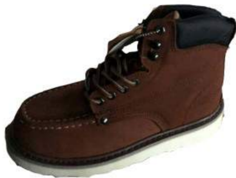
FBOS-RGF6 nubuck leather 6"