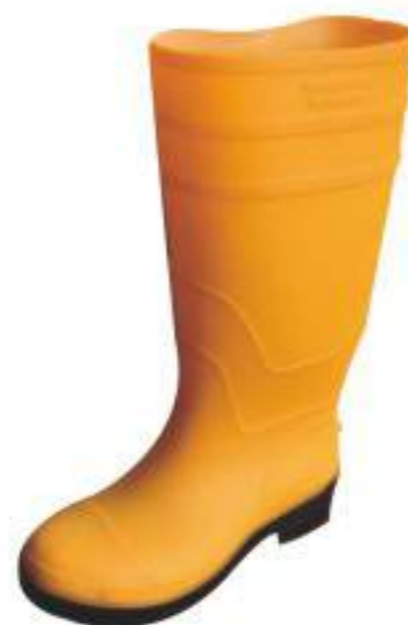
FBOS-WL019 400MM 10pair 22/20kg 50x30x43cm 3700 pairs/20'