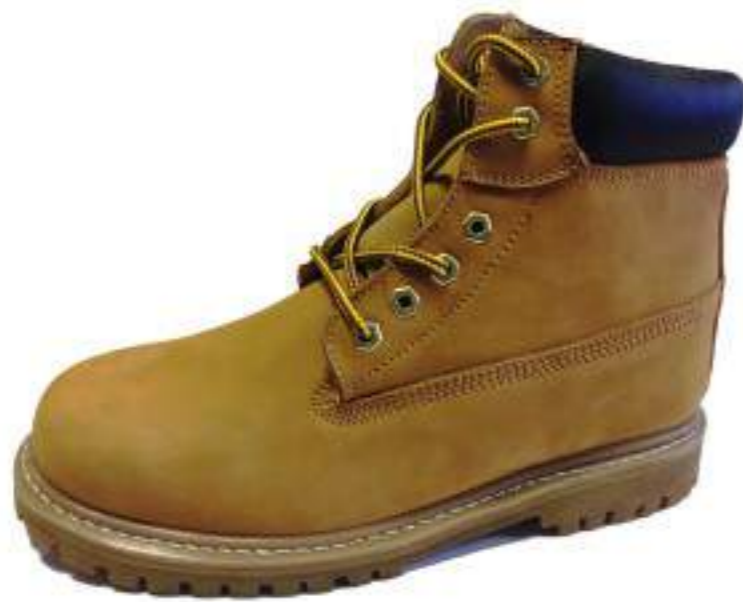
FBOS-YN6 nubuck leather 6"