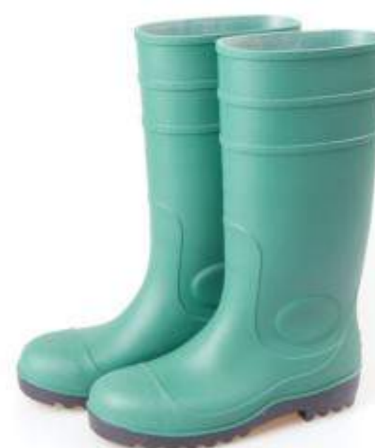
FBOS-ZY005YB 400 mm high 10pairs 23/21kgs 58x40x33cm 3600 pairs/20'