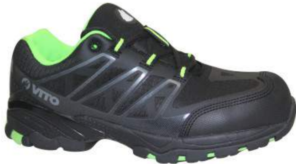
FBOS-HN1008-1 full grain leather+mesh air mesh lining EVA+rubber sole