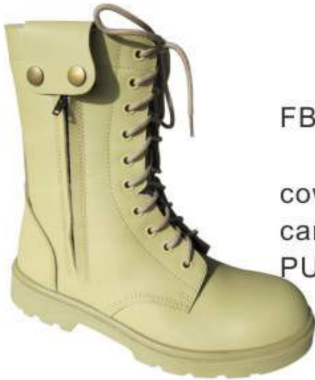
FBOS-AM01 cow grain leather 9" campela lining PU sole