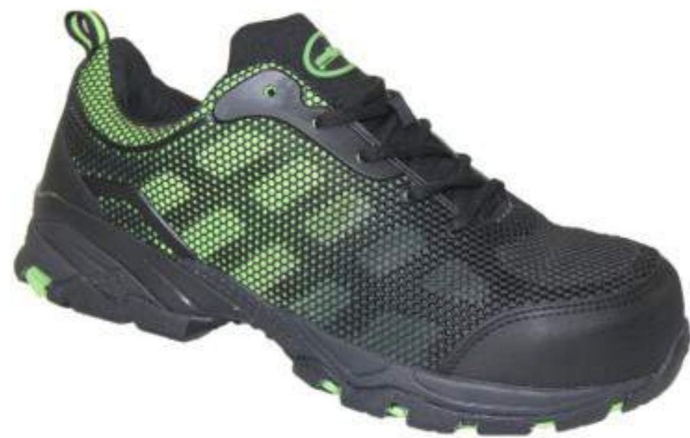
FBOS-1008-8 full grain leather+mesh air mesh lining EVA+rubber sole