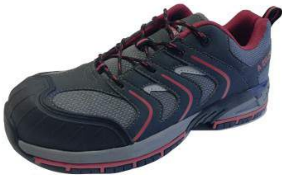
FBOS-HN064 full grain leather air mesh lining EVA+rubber sole