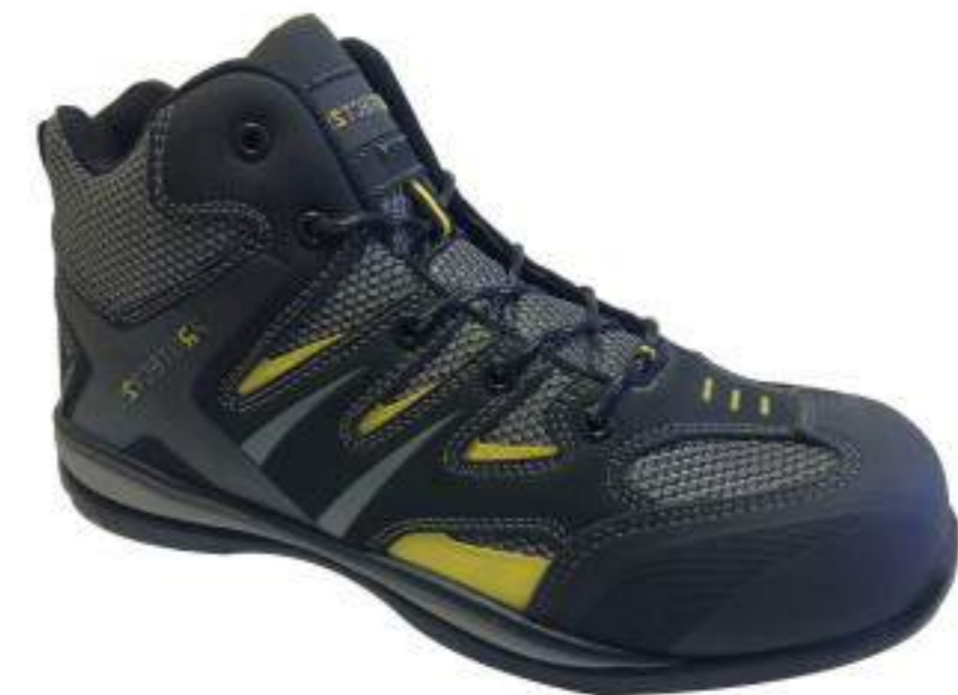
FBOS-HN9006L suede leather 4" air mesh lining EVA + rubber sole