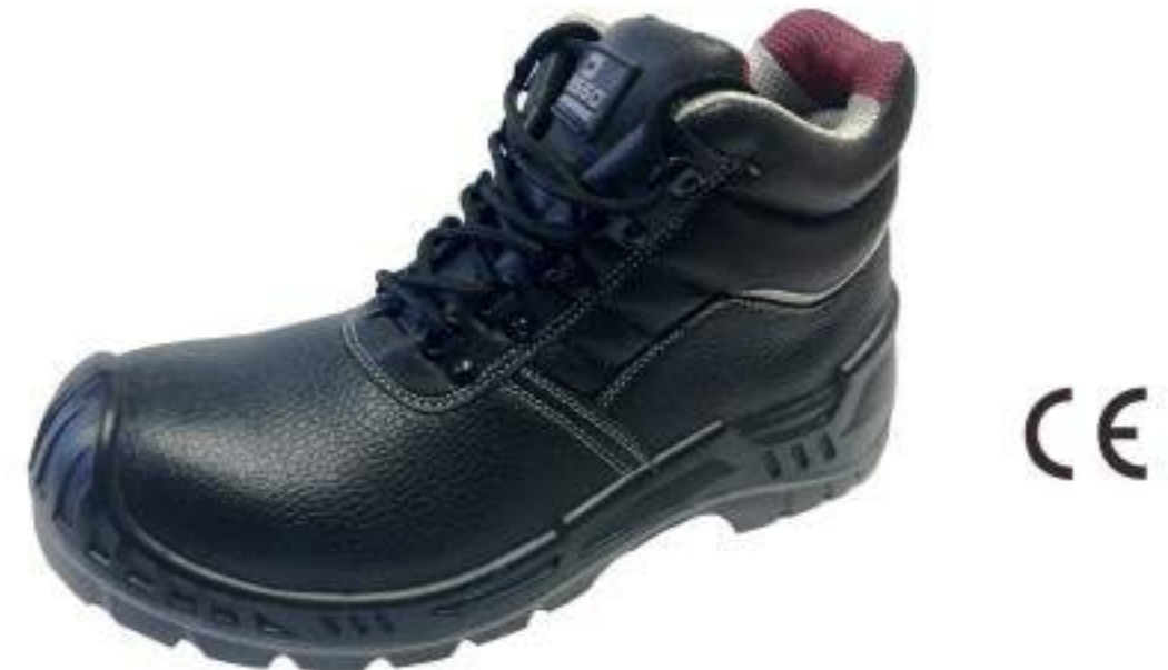
FBOS-UB136 buffalo leather campela lining PU/PU sole