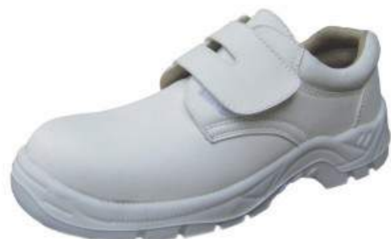
FBOS-UQ544 lorica leather campela lining PU/PU sole