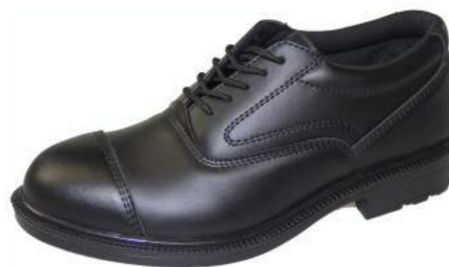
FBOS-PU0401 full grain leather campela lining PU/PU sole