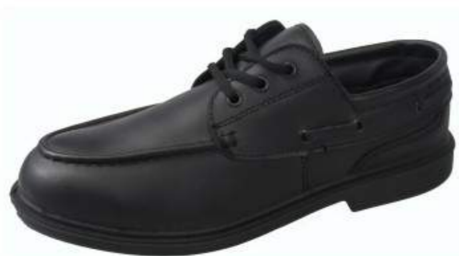
FBOS-PU0409 full grain leather campela lining PU/PU sole