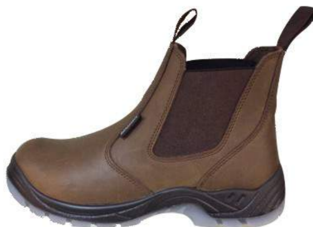
FBOS-UP371B Nubuck leather campela lining PU/TPU sole