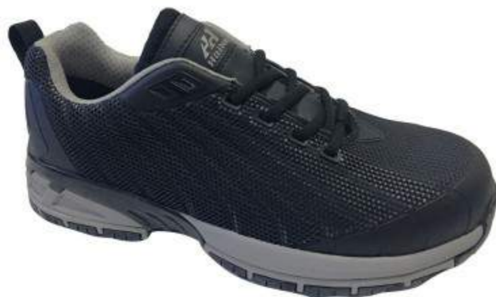
FBOS-HN1009-5 move ground leather air mesh lining EVA + rubber sole