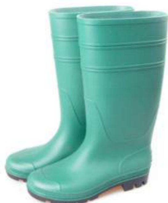
FBOS-GY001GB w/o steel toe w/o steel sole 10pairs 18/16kgs 50x30x43cm 4400 pairs/20'