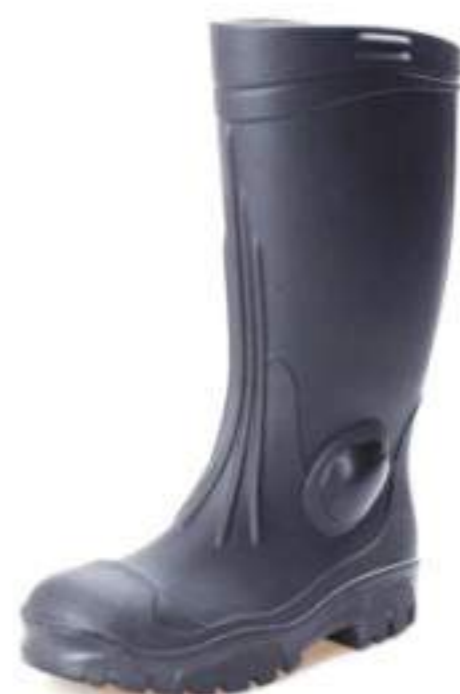
FBOS-ZY008BB w/o steel toe w/o steel sole, with steel toe w/o steel sole, with steel toe with steel sole 10pairs 22/20kgs 50x30x43cm 3700 pairs/20'