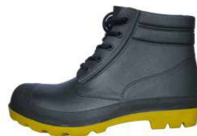
FBOS-ANA-BYA 10pairs 19/17.5kgs 59x31x31cm 5000 pairs/20'