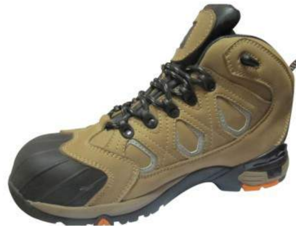
FBOS-HN1514 nubuck leather air mesh lining EVA+rubber sole