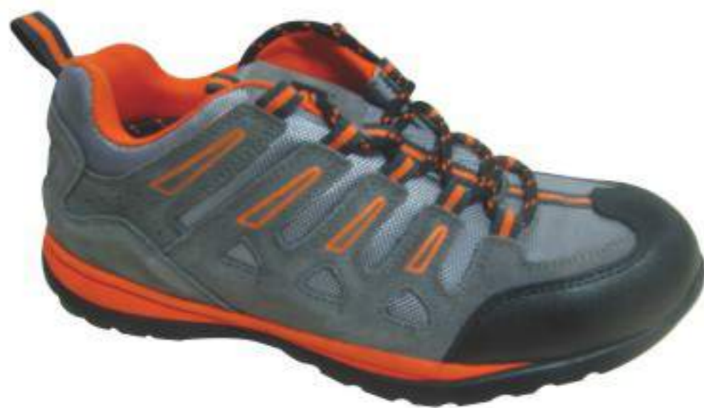
FBOS-HN2 suede leather 4" air mesh lining EVA + rubber sole