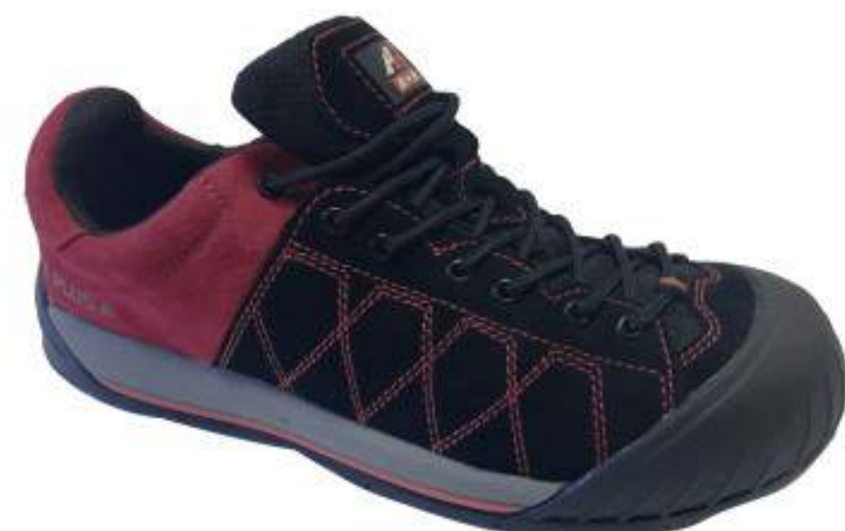
FBOS-HN2001-3Y full grain leather+mesh air mesh lining EVA+rubber sole