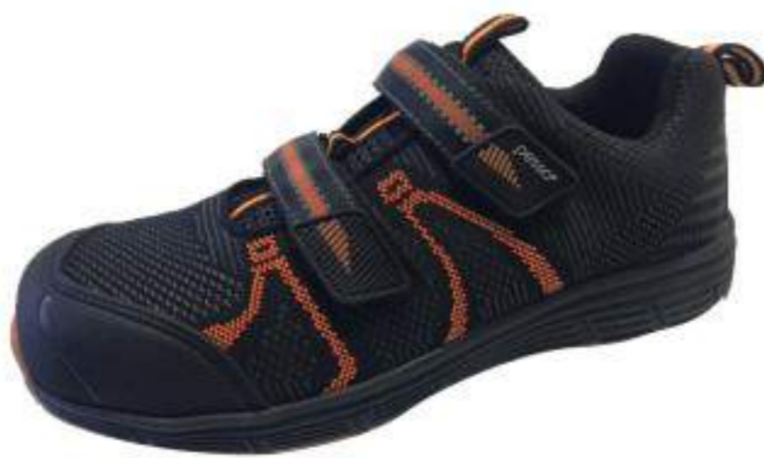
FBOS-2018-1 PU+mesh lining air mesh lining EVA+rubber sole