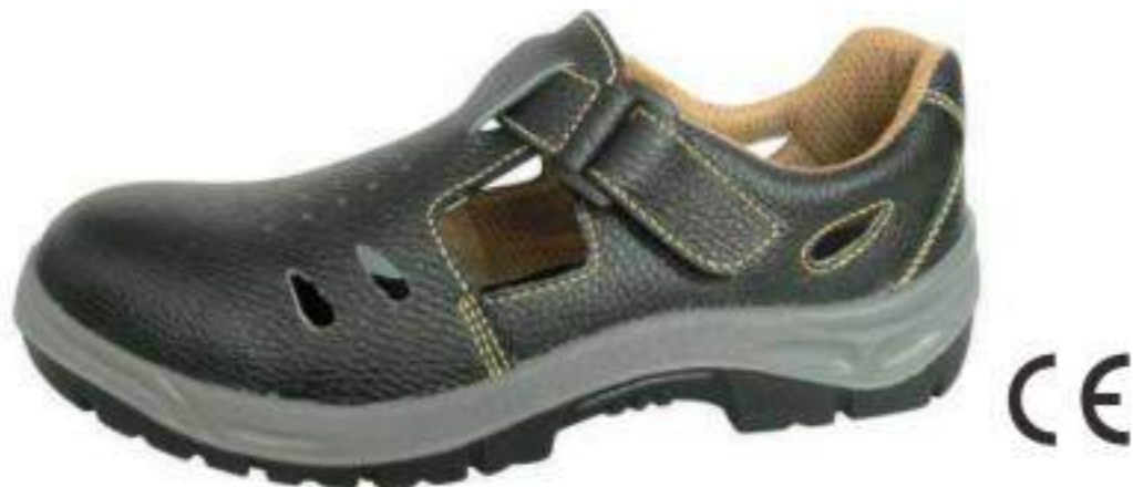
FBOS-713672 buffalo leather campela lining PU/PU sole