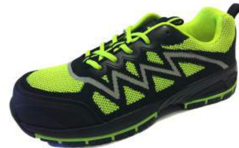
FBOS-2018-2 PU+mesh lining air mesh lining EVA+rubber sole